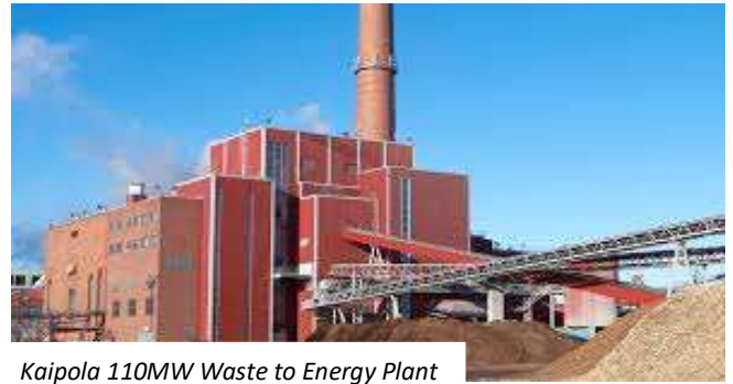
Kaipola 110MW Waste to Energy Plant

The plant is a biomass incineration plant capable of generating 25 MW of electricity and 85MW of steam.