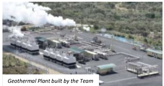
Geothermal Plant built by the Team

Whilst early stage, initial development is projected to deliver around 80MW, with commercial operations expected to begin within 2.5 years.